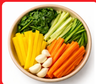
Garlic & Vegies