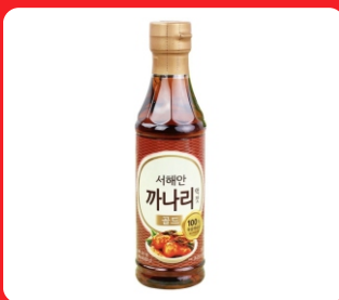
Fish Sauce Optional