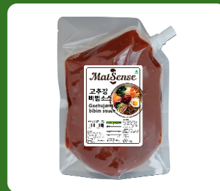
Gochujang Bibim Sauce